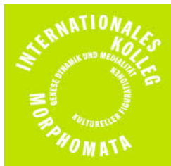
Internationales Kolleg Morphomata. Together with Morphomata the Research Network organized the symposium "GraffitiCity – materialized visual practices in the public urban space" in April 2013