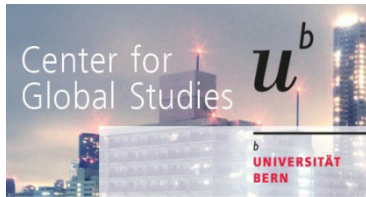
Center for Global Studies of the University of Bern